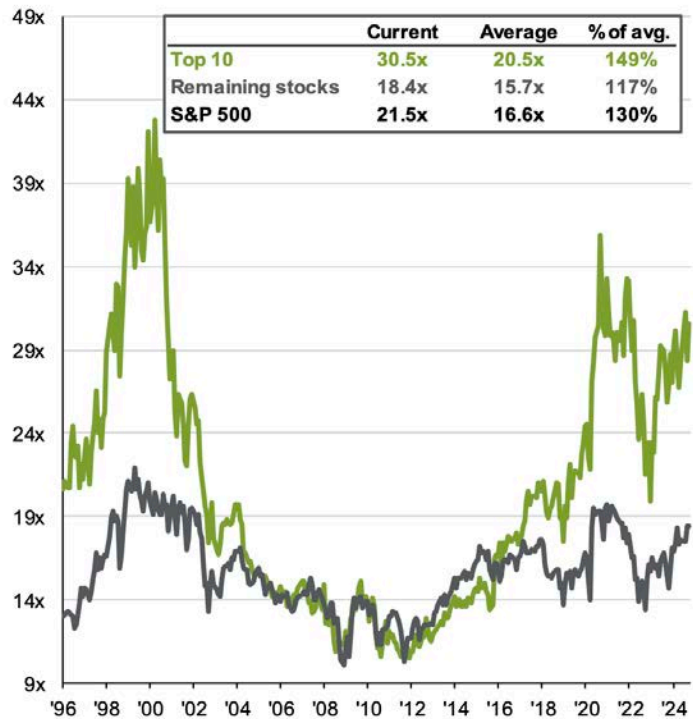
P/E ratio of the top 10 and remaining stocks in the S&P 500 Next 12 months, 1996 - present